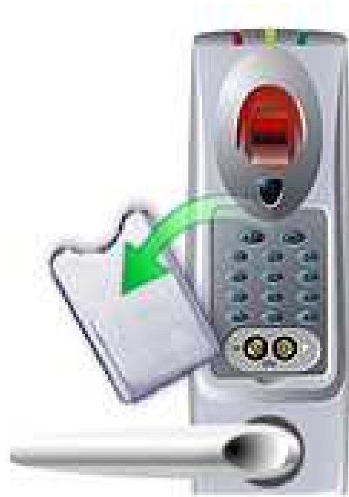
Access to Key Pad