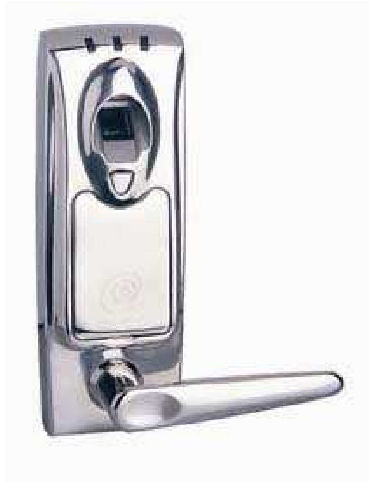
Modern Chrome Finish