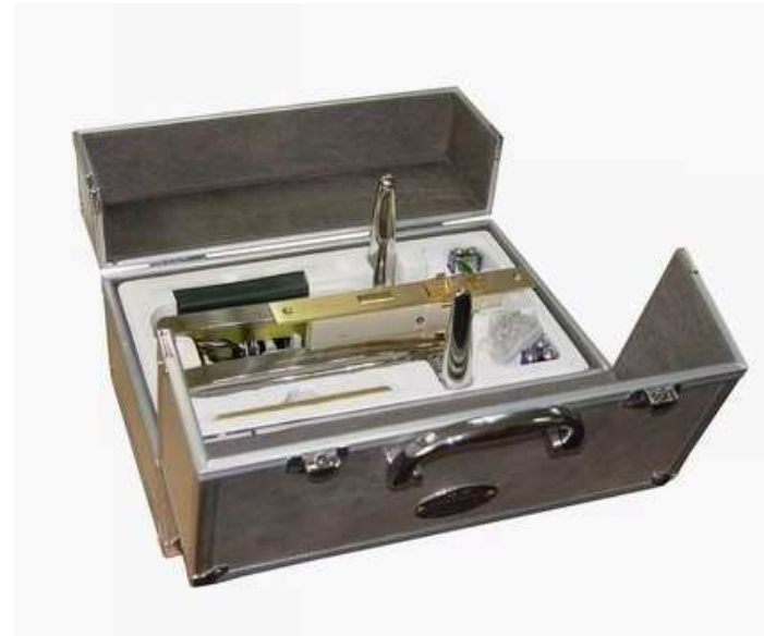
Elegant Packaging – Aluminum Alloy Case